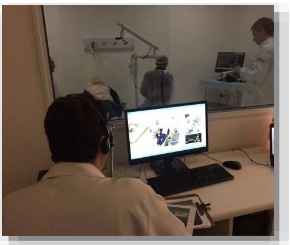
Figure 3. Audiovisual resource control room

The third instructor followed the pairs in the presentation of each proposed case.