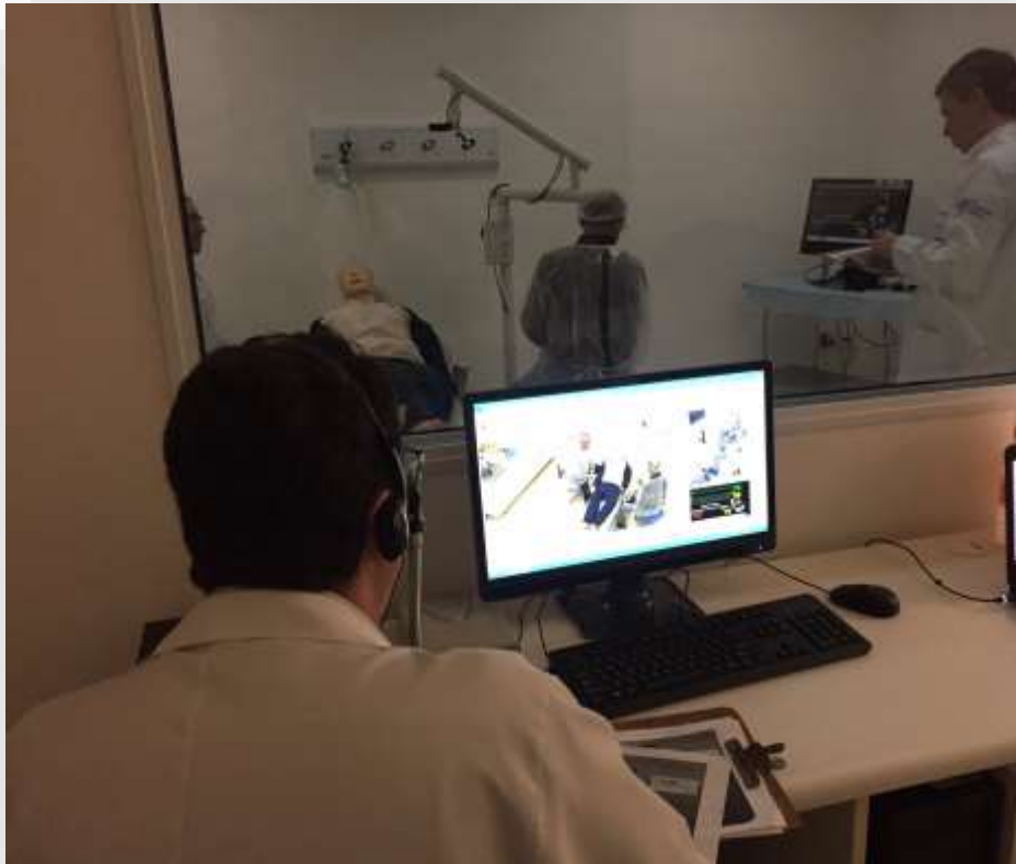
Figure 3. Audiovisual resource control room

The third instructor followed the pairs in the presentation of each proposed case.