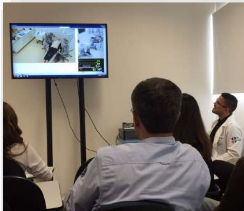
Figure 2. Visualization of the simulation scenario through the debriefing room monitor to follow the simulations

discussion of each simulation scenario performed with the students. Furthermore, these rooms are provided with an audiovisual system integrated with the simulation rooms allowing students who are not in the simulation scenario to watch the entire sequence of each simulated clinical case through different shooting angles (figure 2).